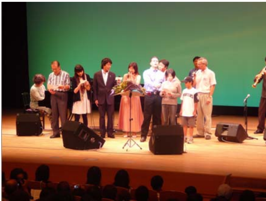
On stage at the Trey Hillman event in Otaru